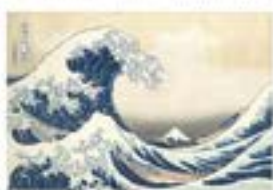
The Great Wave off Kanagawa (大波に小舟) Kanagawa-oki nami-ura! print by Hokusai Metropolitan Museum of Art